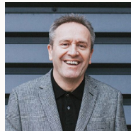
Stephen Matthew Building Church Academy